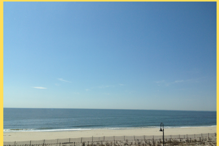
Cape May New Jersey, USA