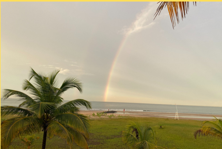
Gambia, West Africa

No Mystery in Black History: A history that crosses the Atlantic Ocean.